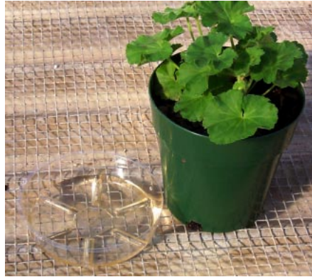
Figure 2e. Collected leachate for testing.

4. Collect leachate for pH and EC (Fig. 2e). Make sure to get about 50 ml of leachate each time (Fig. 2f). Leachate volumes over 60 ml will begin to dilute the sample and give you lower EC readings.