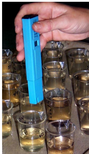
Figure 2h. Testing leachate samples.

6. Measure pH and EC of your samples (Fig. 2h). Test the extracts as soon as possible. EC will not vary much over time provided there is no evaporation of the sample. The pH will change within 2 hours. Record the values on the charts specific to each crop.