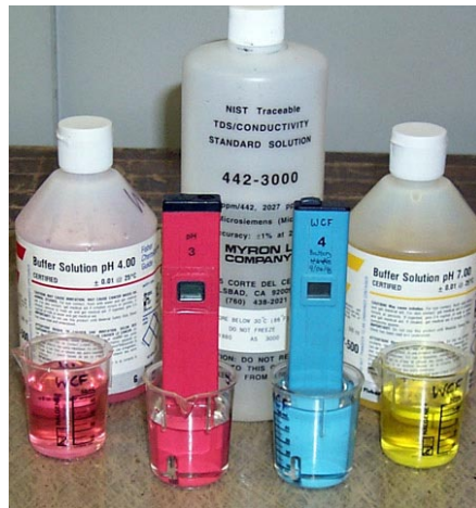
Figure 2g. Calibration standards for testing.

5. Calibrate your pH and EC meters prior to testing (Fig. 2g). The test results are only as good as the last calibrations. Calibrate the instruments every day that they are used. Always use fresh standard solutions. Never pour used solution back in the original bottle.