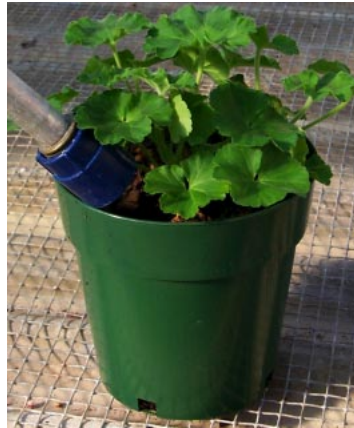
Figure 2a. Irrigate containers thoroughly.

3. Pour enough distilled water on the surface of the substrate to get 50 ml (1.5 oz) of leachate (Fig. 2d). The amount of water needed will vary with container size, crop and environmental conditions. Use the values in Table 1 as guides.