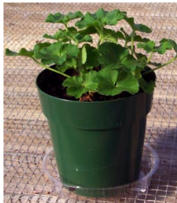
Figure 2b. Saucer for pots.