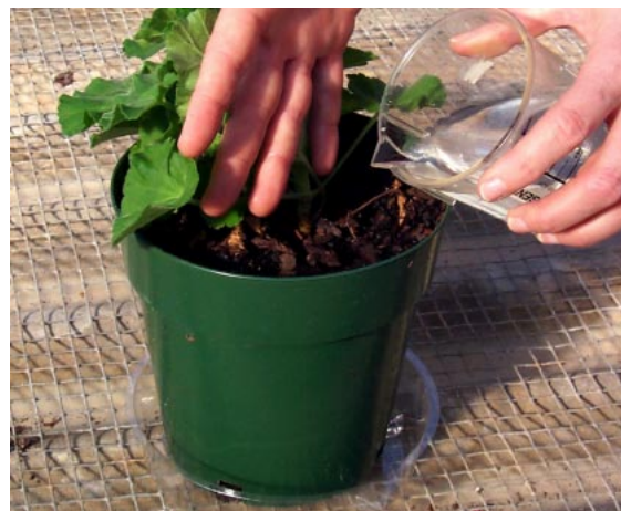
Figure 2d. Applying water for extraction.