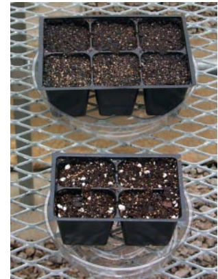
Figure 2c. Saucers for cell packs.