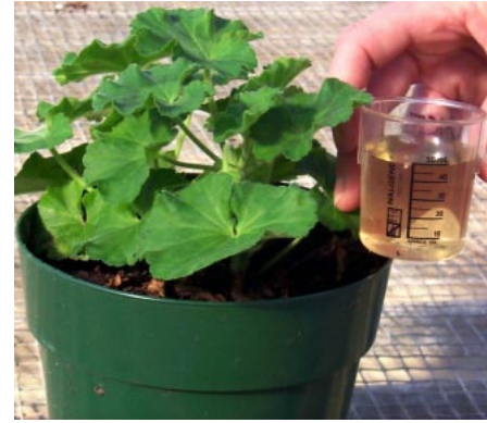
Figure 2f. Collect 50 ml (1.5 ounces) for testing.

5. Calibrate your pH and EC meters prior to testing (Fig. 2g). The test results are only as good as the last calibrations. Calibrate the instruments every day that they are used. Always use fresh standard solutions. Never pour used solution back in the original bottle.